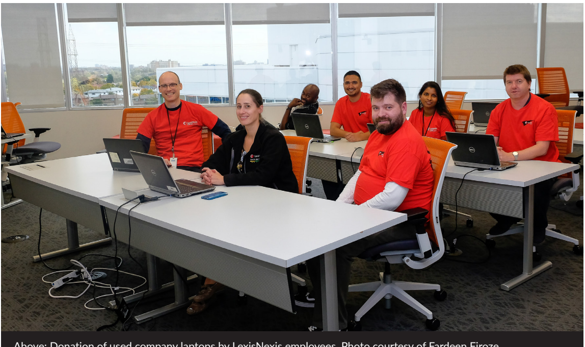
Above: Donation of used company laptops by LexisNexis employees.

As a newcomer to the legal community, I want to thank you for your efforts to promote justice and the rule of law. I look forward to working with you.